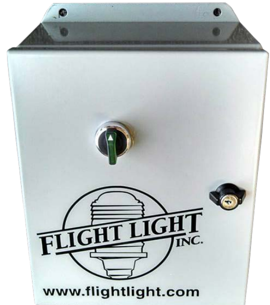
Surge Protector Unit