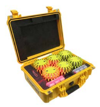
24-Pack with Custom Carry Case: 24 PowerFlare lights with red or amber LEDs in a yellow shell, Pelican case, 24 spare batteries.