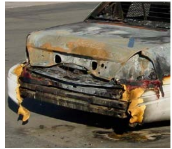
Police car destroyed from accidental combustion of pyrotechnic road flare.