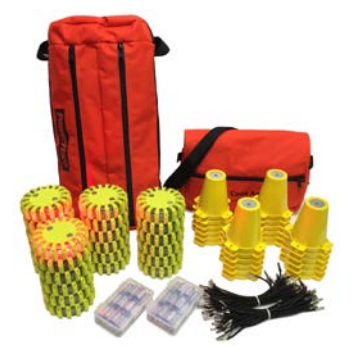
Available kits include one Cone-Top Adapter per PowerFlare, and are available in packages of 2, 4, 8, 12, and 24. Standard kits come with Red, Amber, or Red/ Blue LEDs in yellow shells.