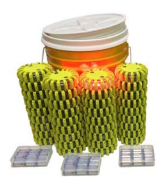
Bucket of Beacons:

Comes in two sizes with white easy-twist on/off reseal lids. Buckets can be ordered with or without a bag of spare batteries.