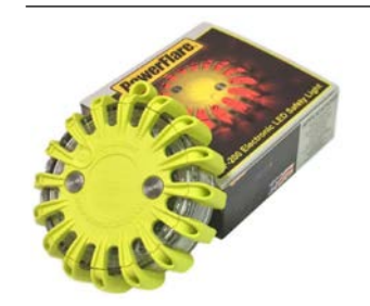
Single PowerFlare Light: With red or amber LEDs in yellow shell with standard retail packaging.