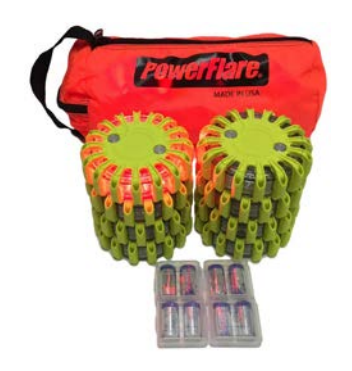
8-Pack with Custom Carry Bag: 8 PowerFlare lights with red or amber LEDs in a yellow shell, 8 spare batteries.