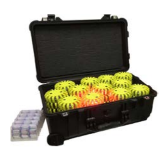
60-Pack with Roller Carry Case: 60 PowerFlare lights with red or amber LEDs in a yellow shell, Pelican case, 60 spare batteries in separate carry bag.