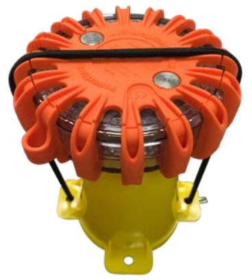
Non-magnetic PowerFlares attach to the Cone-Top Adapter with included elastic cords.