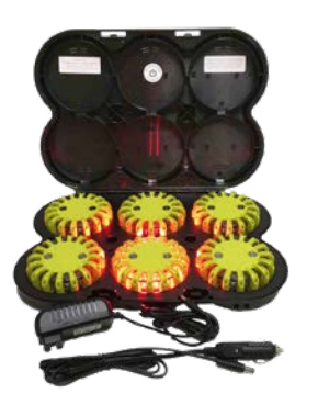
6-Pack Rechargeable System: 6 rechargeable PowerFlare lights with red or amber LEDs in a yellow shell, rugged recharging case.