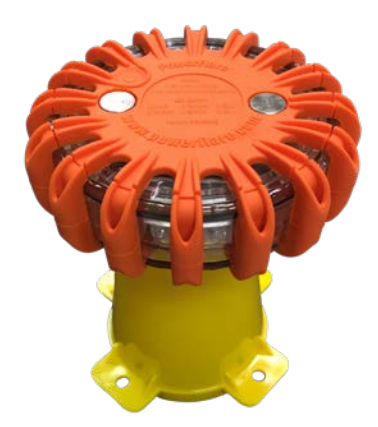
Magnetic PowerFlares attach to an internal piece of metal in the Cone-Top Adapter.