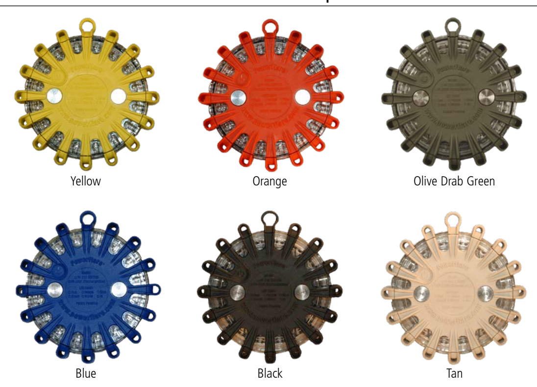
Additional special order LED and outer shell colors are available. Please call for details.