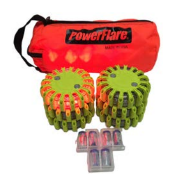
6-Pack with Custom Carry Bag: 6 PowerFlare lights with red or amber LEDs in a yellow shell, 6 spare batteries.