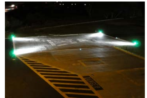
Surface floodlights provide uniform lighting without glare