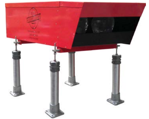
Four legs equipped with frangible floor flanges provide extra stability.