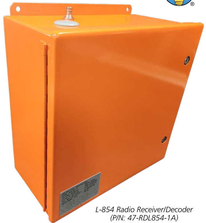
L-854 Radio Receiver/Decoder (P/N: 47-RDL854-1A)