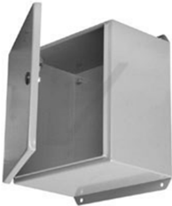
Enclosure Showing Mounting Tabs