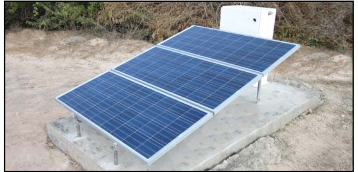
Solar Power Option

The solar power option equips the system to run with free, renewable energy from the sun. Unprecedented in the industry, this green feature is the ideal long-term investment. Ongoing savings afforded by utilizing solar energy are calculated over the lifetime of the installation. Custom solar packages are available to fit your specific load requirements.