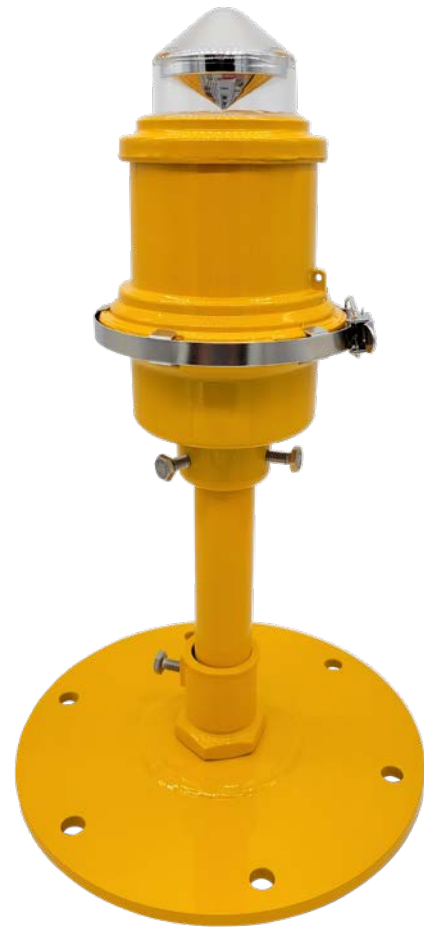
HL-860L LED Heliport Perimeter Light (base plate sold separately)

With the dimming option, the lights can be dimmed at night to reduce glare. Three brightness levels can be selected. The dimming option is only available with a Flight Light 3-Step Dimming Controller.