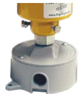
Low Surface Mount No frangible coupling