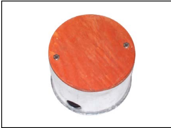
Base Can Shown with Cover Attached