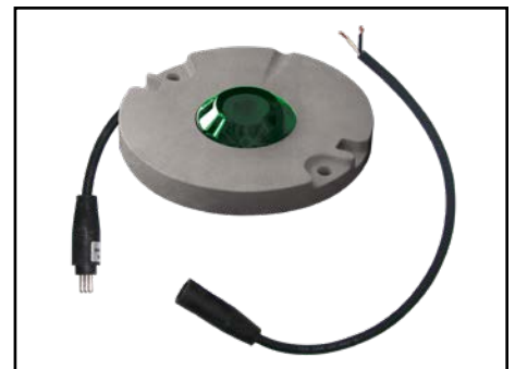
Fixture and Connector