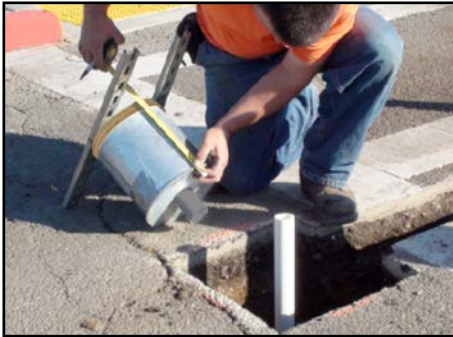
Mounting Jig Attached to Base Can