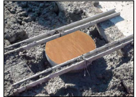
Installed Base Can