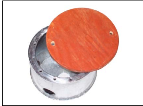
Base Can Shown with Cover Removed