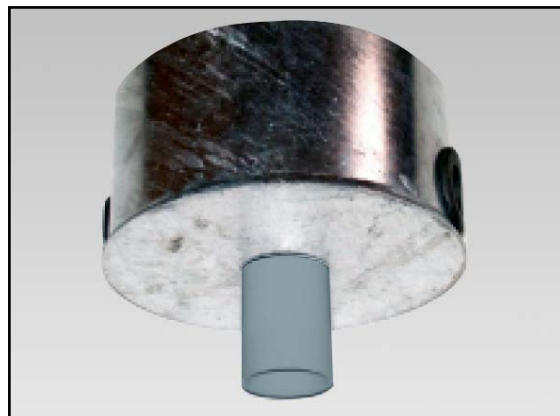
Base Can Shown with Fittings Installed