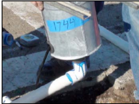
Base Can Attached to Drain Conduit